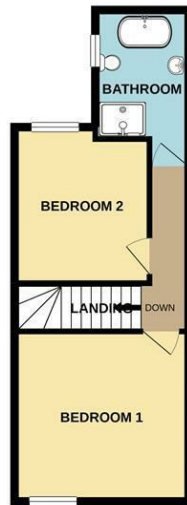
1ST FLOOR 366 sq.ft. (34.0 sq.m.) approx.